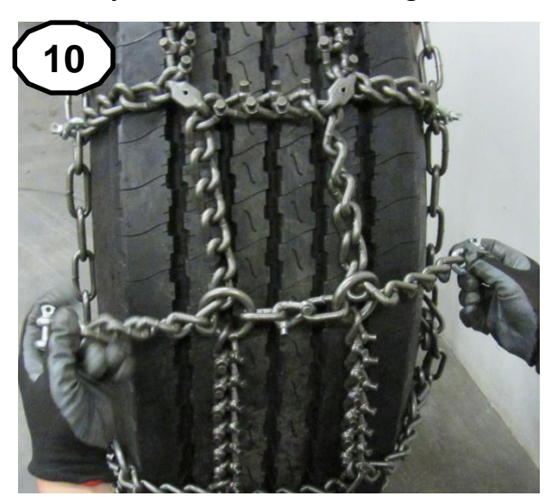
Pull the chain thread through the rings as shown.

In case your chain model has rings to close the chain on tread: