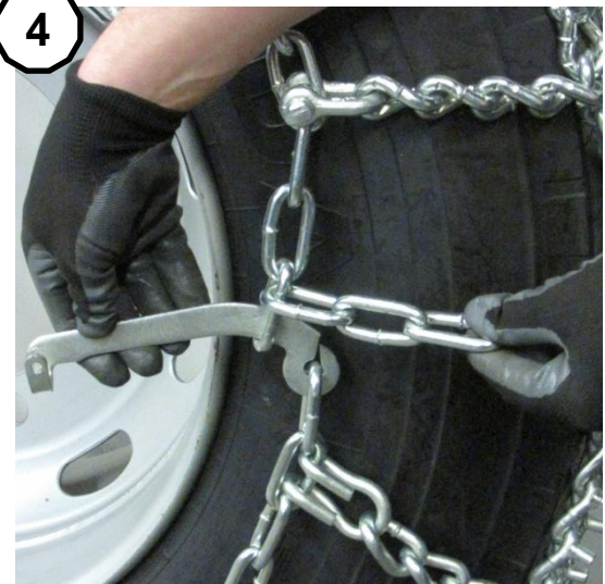
Take tension lever and pull it through a link in the side chain. If possible take back some links to get the chain tensioned well.