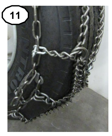
Lock the tread chain on the side chain by shackles.

Repeat step 11 for the other side of the tire.