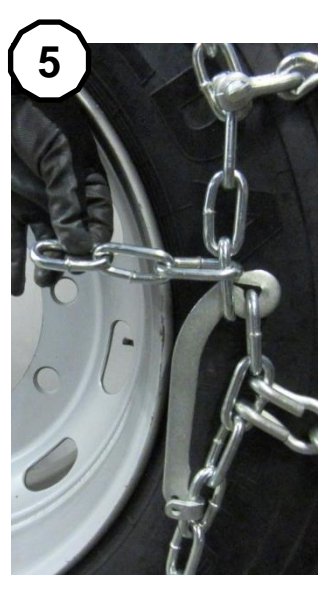
Secure end of tension lever in side chain

Repeat this procedure on inner tire side to tension and lock the inner side chain.