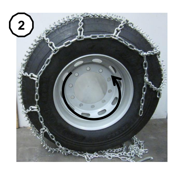
Drive ¼ wheel rotation onward the chain as shown.