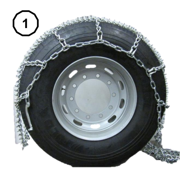
Place chain on the tire as shown with studs pointing away from tread.